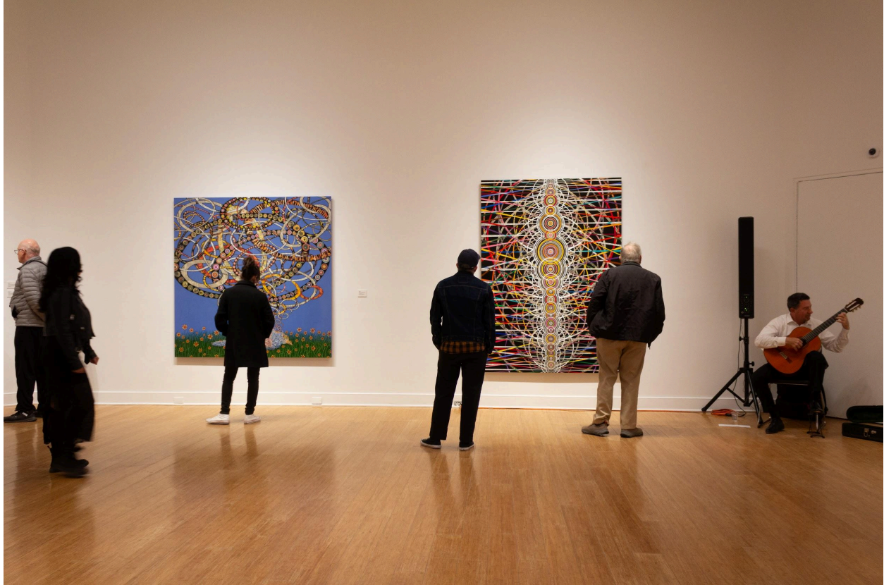
Viewers enjoy the art and live music at the Laguna Art Museum during the First Thursdays Art Walk in Downtown Laguna Beach in Orange County, Calif., on Thursday, Nov. 7, 2024.

In 1929, the first Laguna art gallery was opened by members of the Laguna Beach Art Association ( LBAA ). This original gallery is now a permanent part of the Laguna Art Museum, a centerpiece of the Downtown Laguna art scene and a highlight of the Art Walk.