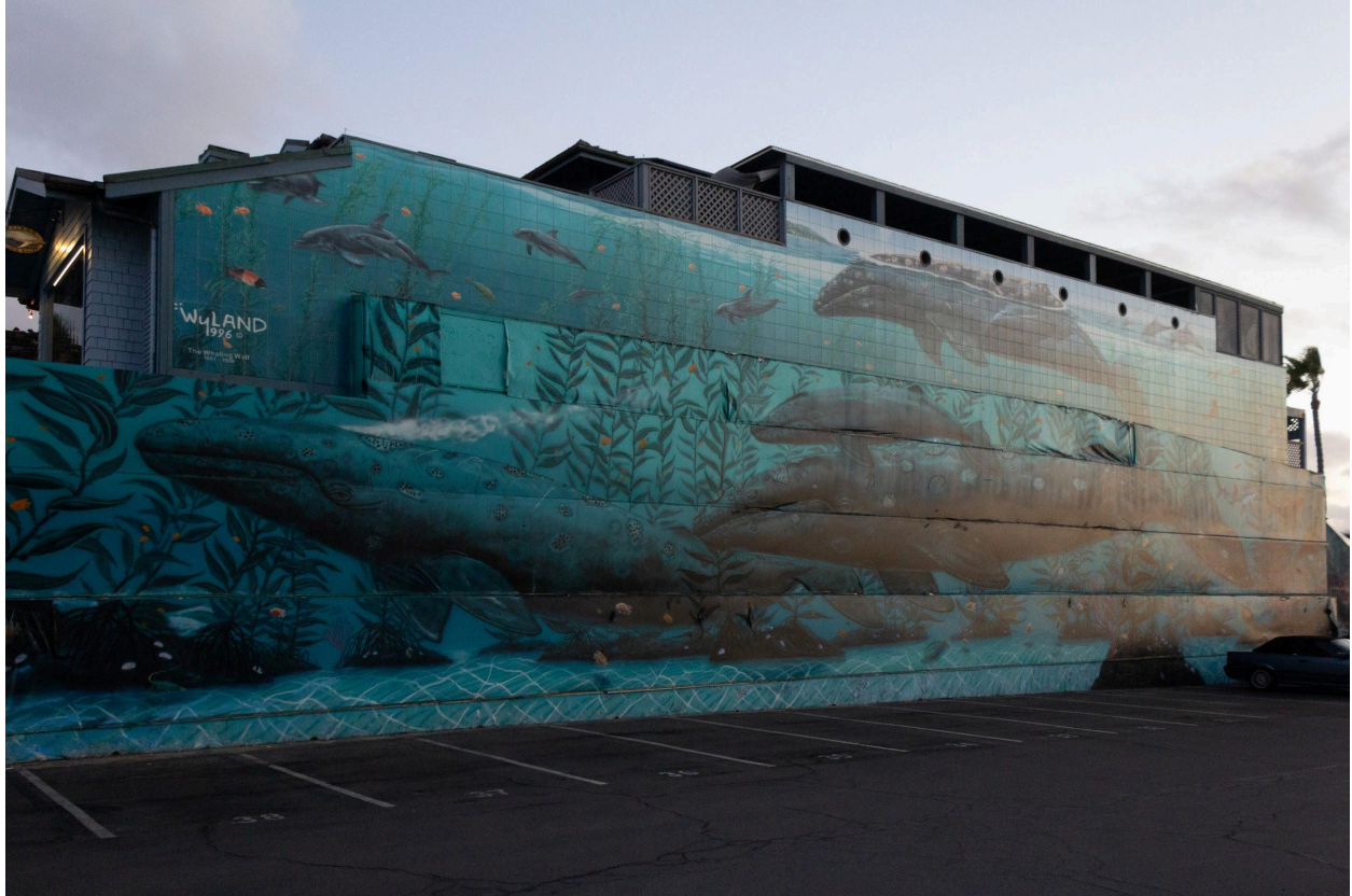
The Whaling Wall mural, completed by Robert Wyland, photographed in Downtown Laguna Beach in Orange County, Calif., on Friday, Nov. 15th, 2024.