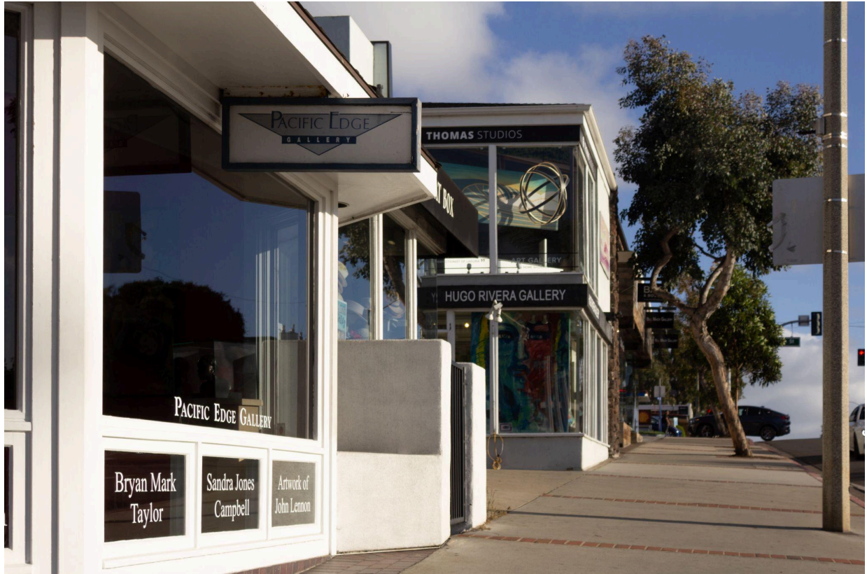
Numerous art galleries line the street of South Coast Highway that bisects Downtown Laguna Beach in Orange County, Calif., on Friday, Nov. 15, 2024.

Remnants of Downtown Laguna's bohemian origins can be found in plain sight - the city embraces architecture of the past, such as Hotel Laguna , constructed in the 1930s, while transforming public spaces into art installations.