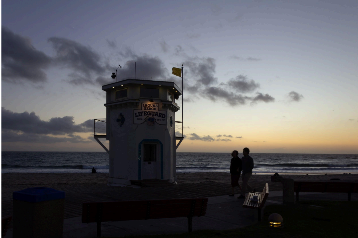
The famous Laguna Beach lifeguard tower sits at the front of Main Beach as passersby enjoy the scenic Laguna Beach sunset in Orange County, Calif., on Friday, Nov. 15, 2024.

Downtown Laguna's scenic positioning and proximity to Los Angeles were utilized during the 1932 Olympics to expand the gallery scene and promote the beauty of Laguna. It has since gained its reputation as a hub for the arts due to its ability to let artists work amongst the natural world.