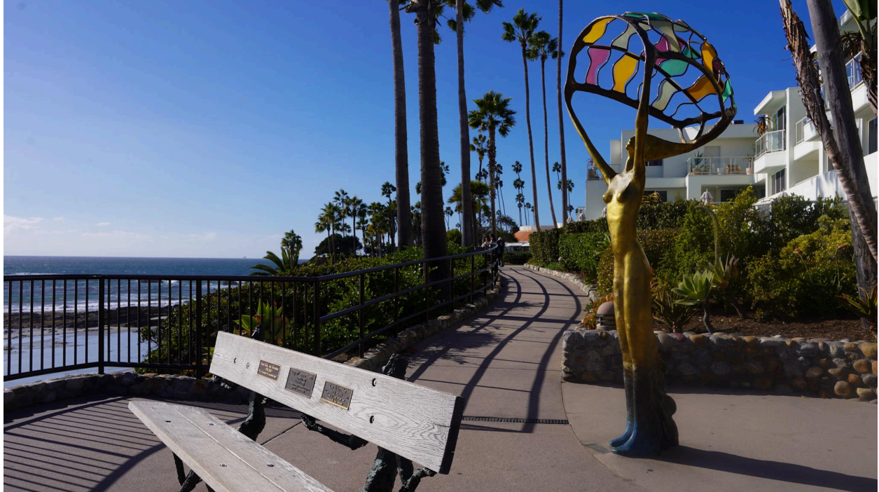
Sukhdev Dail's 2015 sculpture, Sea Breeze , located at Heisler Park in Downtown Laguna Beach, Calif., on Friday, Nov. 15, 2024.

Such as the coastal walking path in Heisler Park that takes you past multiple structures, one of the most recognizable being muralist Robert Wylands, "Whaling Wall 1 - Gray Whale and Calf."